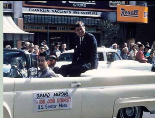
John F. Kennedy, soon to be elected US President, served as Parade Grand Marshal in 1960.

Today, the Medford Pear Blossom Parade involves nearly 4000 participants with over 30,000 people lining the route.