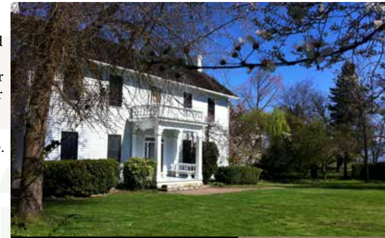
The Hanley home completed in 1875 was for many years the showplace of Jackson County.